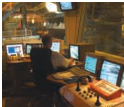
PLATE QUALITY INSPECTION

If you ever face an unexpected breakdown, SSAB Oxelösund has a worldwide network of stocks and can easily supply you with the stock plate that meets your requirements. You can also activate our technical support at short notice.